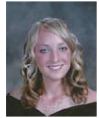
Brittany Ridge CA Inland Empire Camp 971 $500 Woodmen of the World Endowment Scholarship